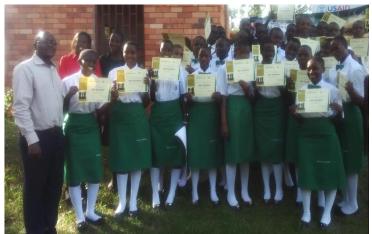
Students of St Theresa Girls School Bwanda after a job shadow session at Masaka Diocese.